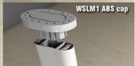
WSLM1 ABS cap