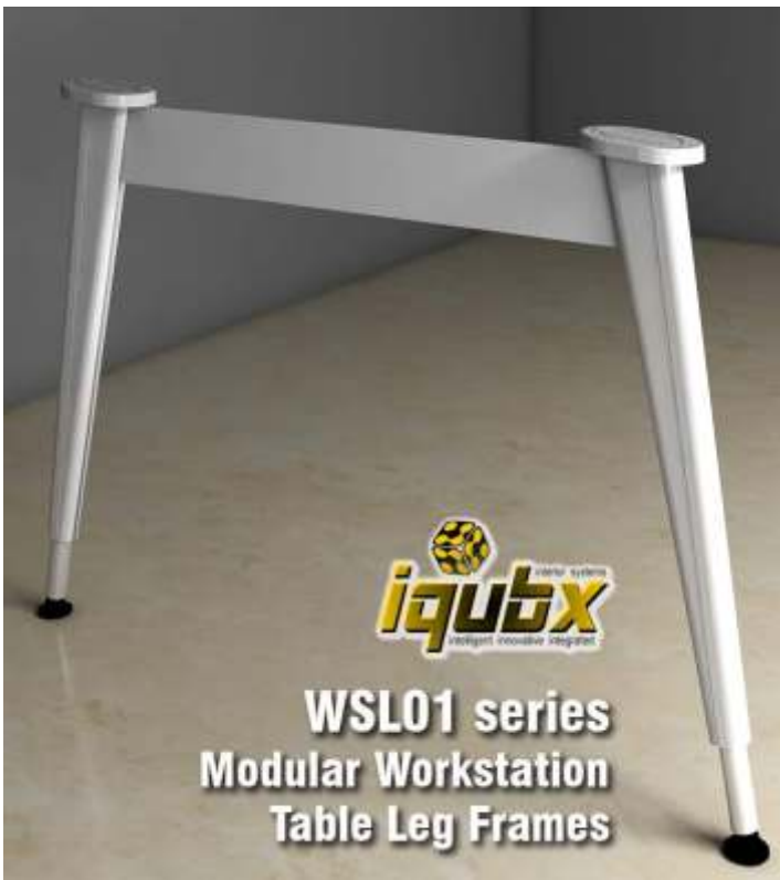
WSL01 series Modular Workstation Table Leg Frames

WSL01 can be assembled together to form a WSL01F frame, a two leg gable end of a workstation desk or table. WSL01F is available in a single gable end of 2 legs or as a complete frame for a workstation or conference table.